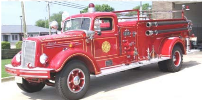
The Mack in 2009