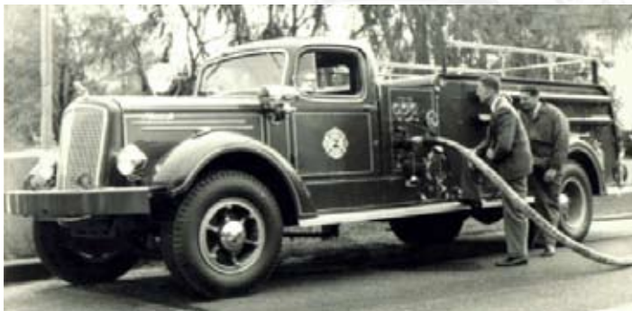
The Mack in 1950